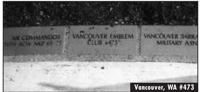
Vancouver, WA #473