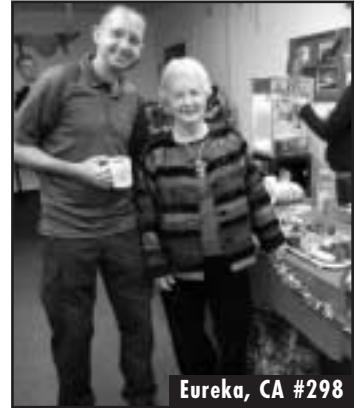
Eureka, CA #298