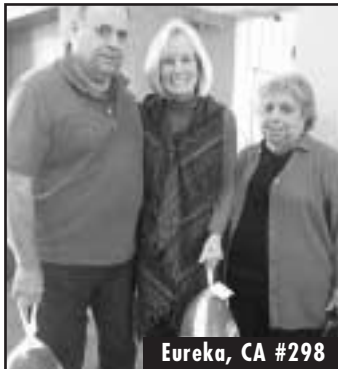
Eureka, CA #298