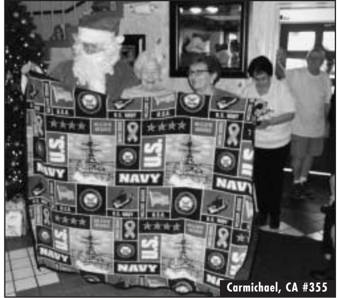
Carmichael, CA #355