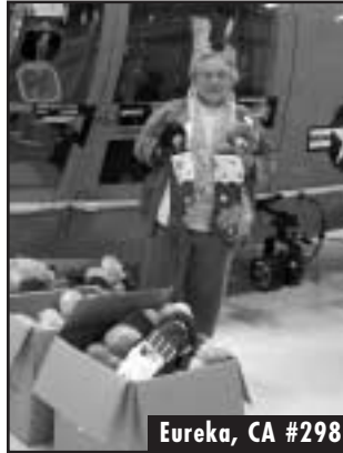
Eureka, CA #298