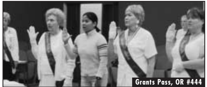
Grants Pass, OR #444