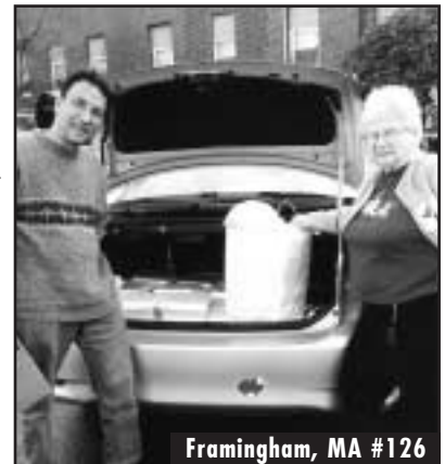
Framingham, MA #126

The Sisterhood and Brotherhood of Temple Beth Am served Christmas dinner to seniors of Framingham Housing on Christmas Day. The Turkey dinners and all the fixings were prepared by the owner of Kugel's Deli. This event was arranged by the Housing Authority in Framingham. After all the seniors were fed, 40 meals