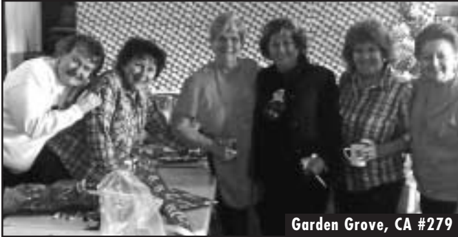
Garden Grove, CA #279