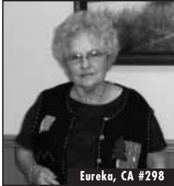
Eureka, CA #298