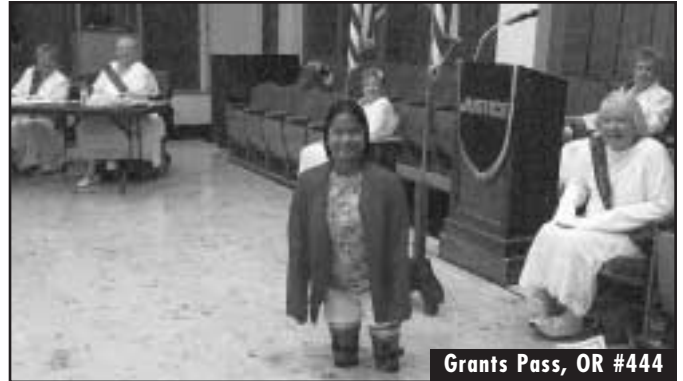
Grants Pass, OR #444