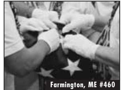
Farmington, ME #460

Farmington Emblem Club #460 members performed a Flag Folding demonstration at Walmart in Farmington on Veteran's Day. (Pictured: Are the hands of Farmington Emblem Members hands tucking the Flag in.)