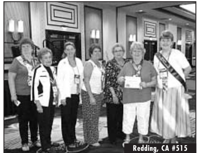
Redding, CA #515

Vancouver, WA #473: Vancouver Emblem Club #473 is an active member of the Community Military Appreciation Committee in Vancouver, WA. At a recent ceremony the POW/MIA Monument was dedicated, including a brick that recognizes Vancouver Emblem Club #473!