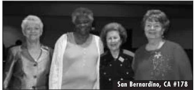
San Bernardino, CA #178