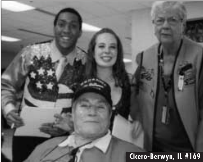
Cicero-Berwyn, IL #169

Woonsocket, RI #27: Members brought in all the fixings for an ice cream social for our Veteran's Home in Woonsocket. It was our pleasure to serve them with a day of sharing and appreciation for their service to our country.