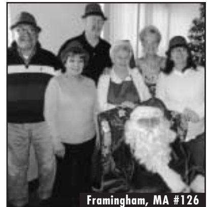
Framingham, MA #126

The Framingham Elks #1264 had another successful Children's Christmas Party this year with the help of the Framingham Emblem Club #126. Children of all ages waited patiently for Santa Claus to appear and read them the "Night