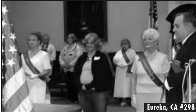
Eureka, CA #298