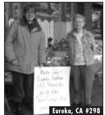
Eureka, CA #298

Montpelier, VT #369: At the November business meeting a $100 donation was made to the Kiwanis Club. They purchase warm clothing and boots for children of the area, along with toys where needed.