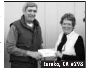
Eureka, CA #298

Montpelier, VT #369: At the November business meeting a $100 donation was made to the Kiwanis Club. They purchase warm clothing and boots for children of the area, along with toys where needed.