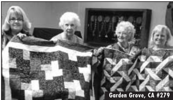
Garden Grove, CA #279

Manchester, CT #251: Manchester Lodge of Elks held a Veterans luncheon and Manchester #251 was happy to donate money to provide gifts to some of the Veterans in attendance.